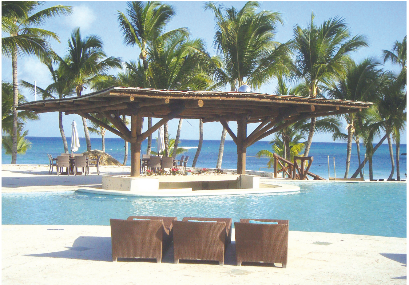
Paradisus Palma Real